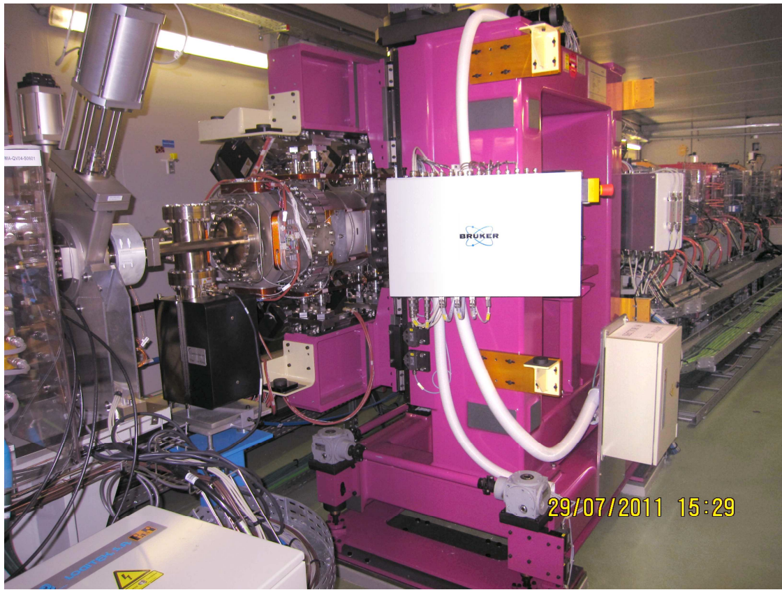
Figure 1.IDs: In vacuum undulator 1 (IVU-1) for BL13-XALOC is ready for operation.