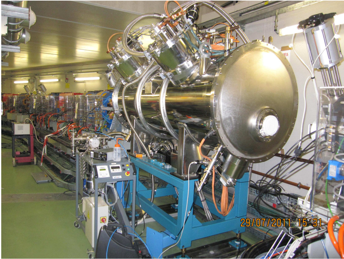
Figure 3.IDs: The superconducting wiggler (SCW) for BL04-MSPD at final position and being pumped down.